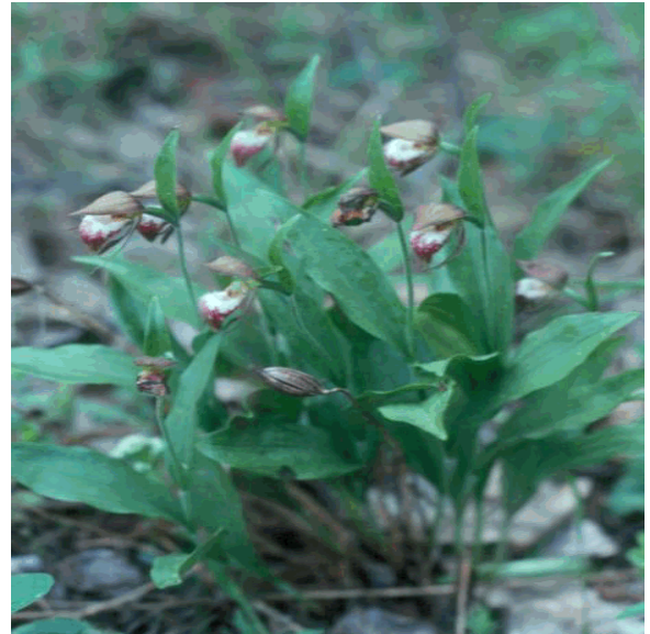
Wright, R. © SERM

Ram's-head Lady's-slipper is around 10-50 cm in height with a slender and hairy stem. It has 3-5 leaves which are deep green, elliptical and strongly ribbed. These are arranged in a rough spiral around the stem. The flowers are solitary with scape to 15 cm. The Petals and sepals are greenish-brown and linear. The lip is white with red veined cross hatching, although sometimes the veins are hard to see. The lip is also prolonged downward into a small conical pouch with the circular mouth of the lip covered with white hairs. The specific epithet arietinum is the Latin meaning "like a ram,".