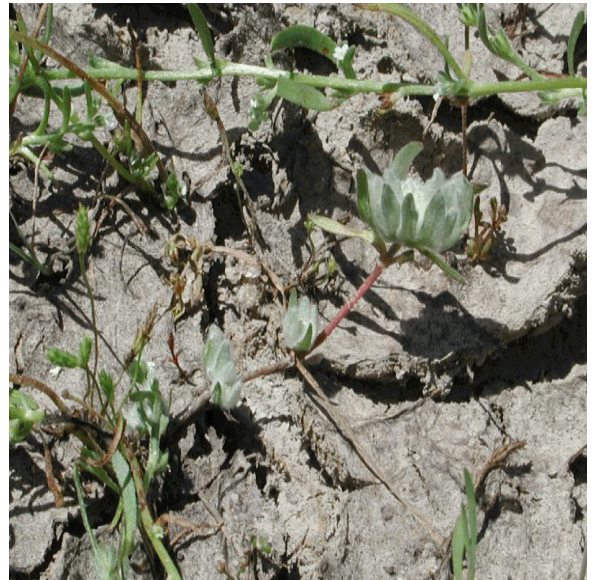
Lamont, S. © cdc

Currently no identification comments for this species.